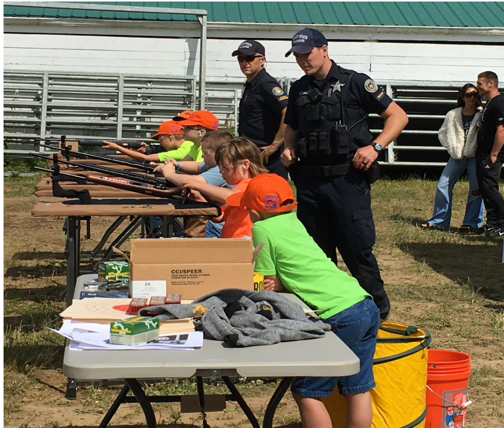
Above OSP Officers provide instruction to kids at the Clatsop OHA Youth Shoot.

See Banquet ticket order form on pages 3-4.